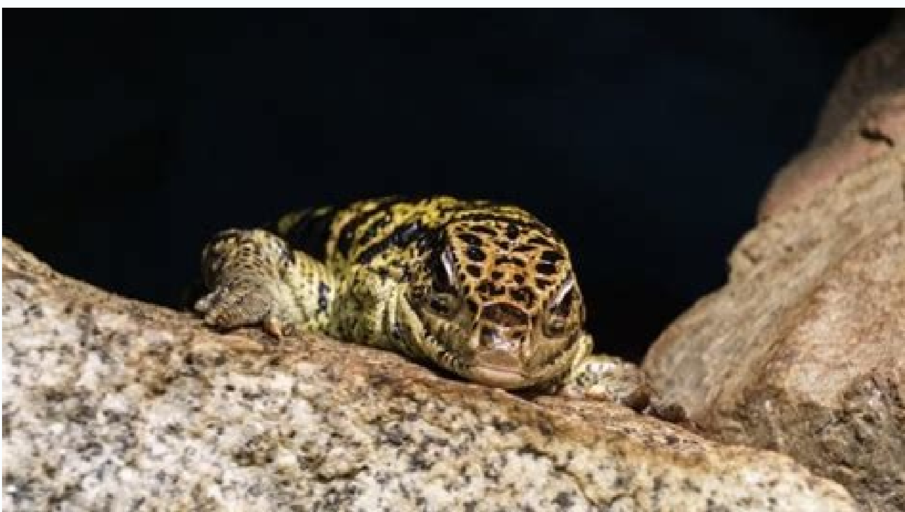
Crocodile skink setup.